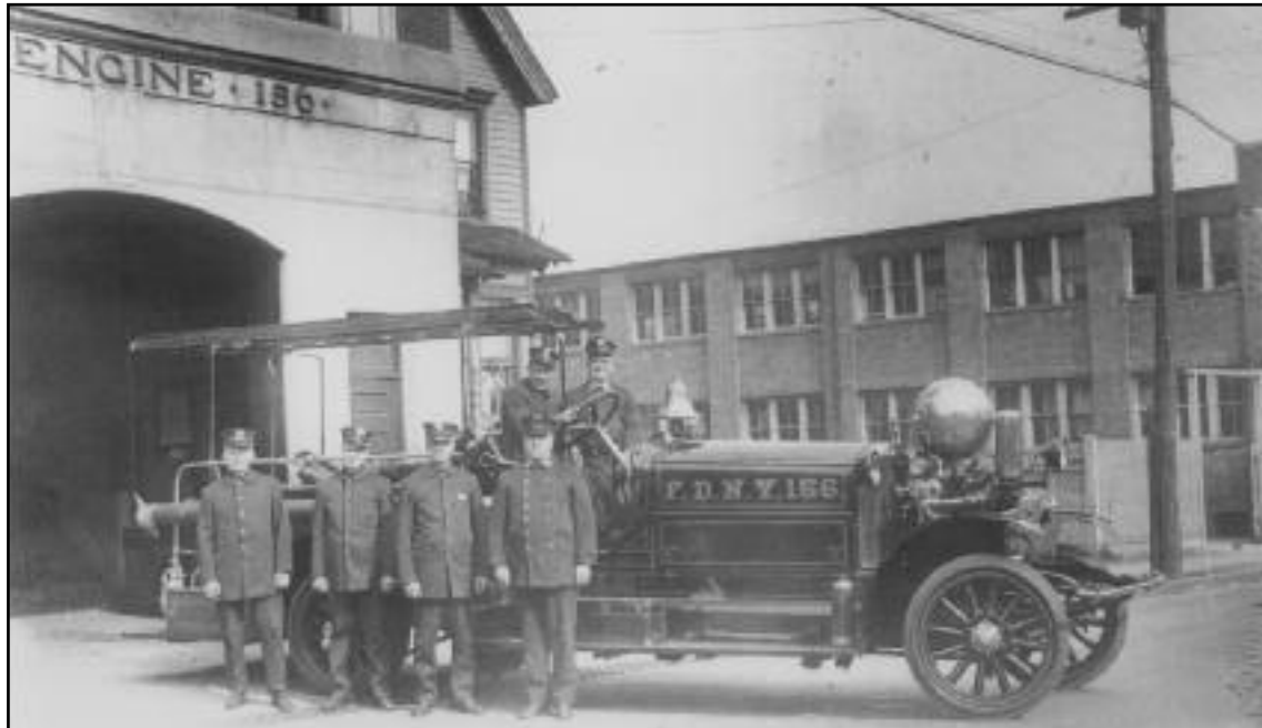
The officers and members of Engine Co. 156 are pictured in front of their quarters at 412 Broadway, West New Brighton, Staten Island, with their 1915 Ahrens Fox pumper. Engine Co. 156 was one of the original paid fire companies on Staten Island having been organized on October 1, 1905.

This calendar, workchart, and information directory is published as a membership service by the UFA. The UFA is the labor union and official bargaining agent representing all Firefighters, Fire Marshals & Marine Wipers, Pilots and Engineers who loyally serve the people of New York City each & every day.