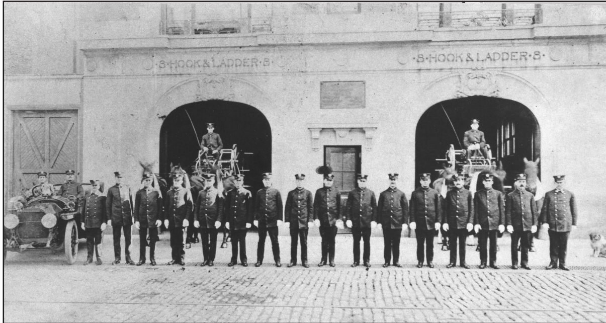
Officers and members of Ladder Company 8 outside their quarters in lower Manhattan at 14 North Moore Street. Originally a double ladder company, their firehouse was cut in half for the widening of Varick Street in 1914. Years later Ladder Company 8's firehouse was used for the filming of the Ghostbusters movie.

This calendar, workchart, and information directory is published as a membership service by the UFA. The UFA is the labor union and official bargaining agent representing all Firefighters, Fire Marshals & Marine Wipers, Pilots and Engineers who loyally serve the people of New York City each & every day.