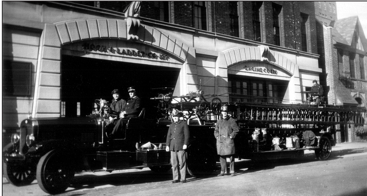
Members of Ladder 127 in front of the old quarters which was known as the Jamaica Big House, which opened in 1925. The firehouse was located on 162 nd Street between Jamaica Avenue and 89 th Avenue. Ladder 127 shared these quarters with Engine 275, Engine 298, Engine 299 and Battalion 50. Ladder 127 was the last unit moved to new quarters, in 1965.

This calendar, workchart, and information directory is published as a membership service by the UFA. The UFA is the labor union and official bargaining agent representing all Firefighters, Fire Marshals & Marine Wipers who loyally serve the people of New York City each & every day.