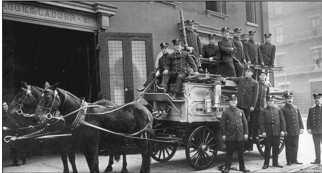
Members of Engine 202 (then numbered Engine 102) stand in front of quarters at 199 Van Brunt St. near Seabring St. in Red Hook, Brooklyn. They shared quarters with Ladder 101 (then numbered Ladder 51). Both companies moved to their present day firehouse in 1960. This old firehouse pictured above, recently restored, is the new location of Friends of Firefighters.

The UFA is the labor union and official bargaining agent representing all Firefighters, Fire Marshals & Marine Wipers who loyally serve the people of New York City each & every day.