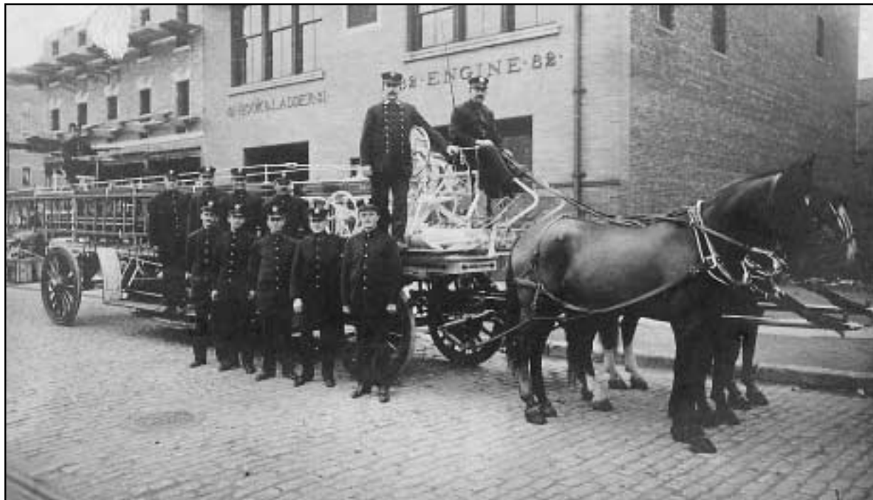
Officer and members of Ladder 31 in the Bronx stand outside their quarters at Intervale Ave. & East 169 th Street shortly after they were organized in 1907.

This calendar, workchart, and information directory is published as a membership service by the UFA. The UFA is the labor union and official bargaining agent representing all Firefighters, Fire Marshals & Marine Wipers who loyally serve the people of New York City each & every day.