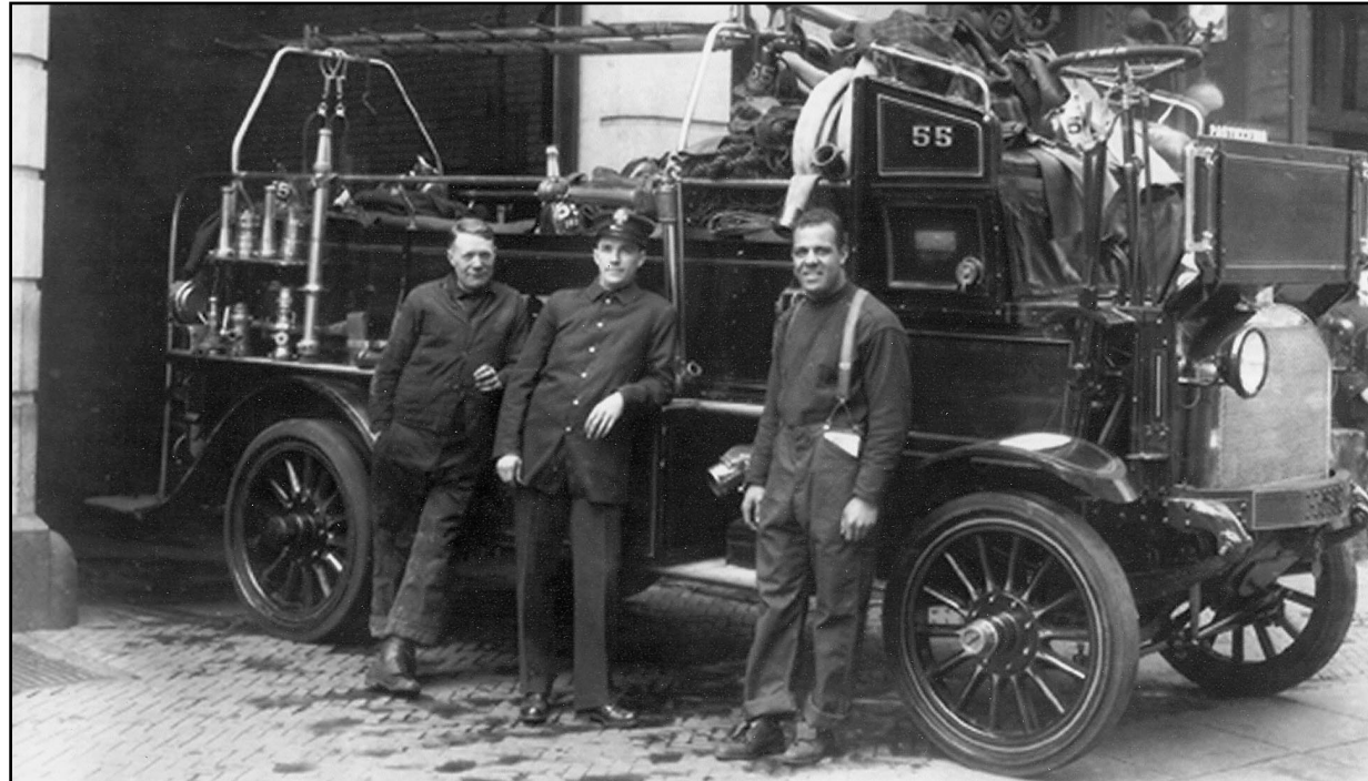
Members of Engine Company 55, in front of their quarters at 363 Broome Street in lower Manhattan, stand alongside their 1914 Mack Hose Wagon.

This calendar, workchart, and information directory is published as a membership service by the UFA. The UFA is the labor union and official bargaining agent representing all Firefighters, Fire Marshals & Marine Wipers who loyally serve the people of New York City each & every day.